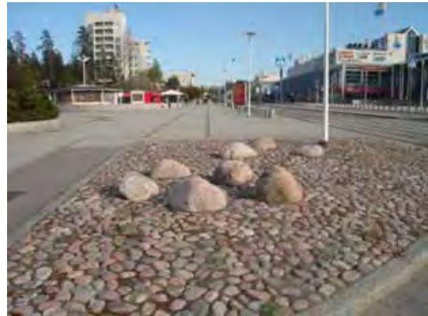
Fig.5. Decoration in Espoonlahti.