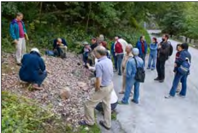
Fig. 2: Learning the geoconservation protection and management reality in the natural monument Gorge Dovžanova soteska.