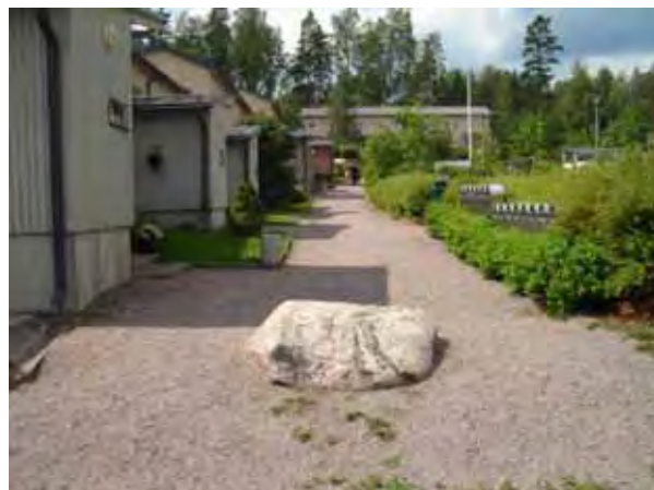
Fig 4. Driving obstacle