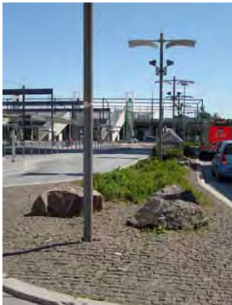
Fig 8. Use of stone outside a supermarket in Leppävaara.

Presentation at the 15th Meeting of the Association of European Geological Societies (MAEGS15) Estonia, September 2007.