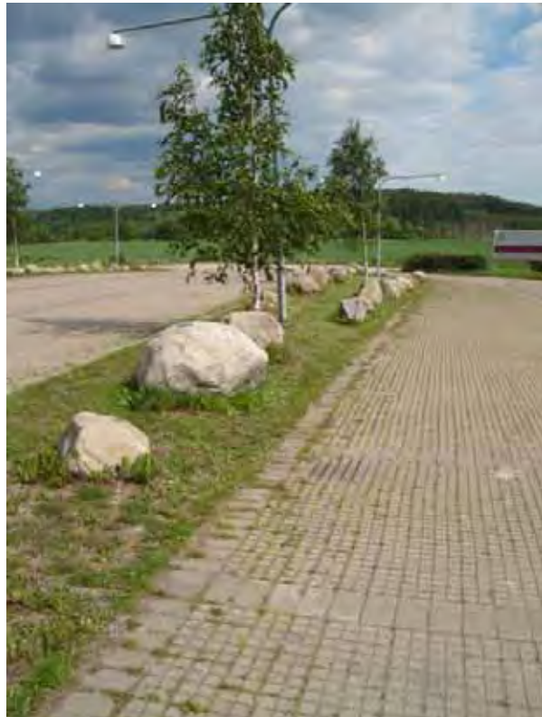
Fig 3. Parking at Ikea

ders are not erratic in the sense that they were not transported to a place by a glacier, but installed by man. The aim of these installations is aesthetic and practical. Boulders are used to limit parking areas, decorating the place at the same time. One of the examples is the parking area of a famous furniture shop (Fig. 3). They were installed along lines towards a crop surrounded by forest. In residential areas, boulders are also used to avoid car traffic in walking ways (Fig. 4). This practical application has been used since 1960's.