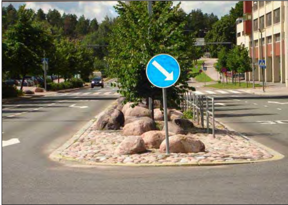
Fig 7. Road environment in Espoon keskus

installed by a contracted construction company. This kind of rock installation is also used outside of a shopping centre located at Leppävaara (Fig. 8). There strongly angular boulders extracted directly from the bedrock were installed in a “cubistic” fashion. A similar, but more massive example is found surrounding a gas station at Bemböle (Fig. 9). Erratics are mainly local, extracted directly from the more-nic ground, exposed by excavation of construction sites.