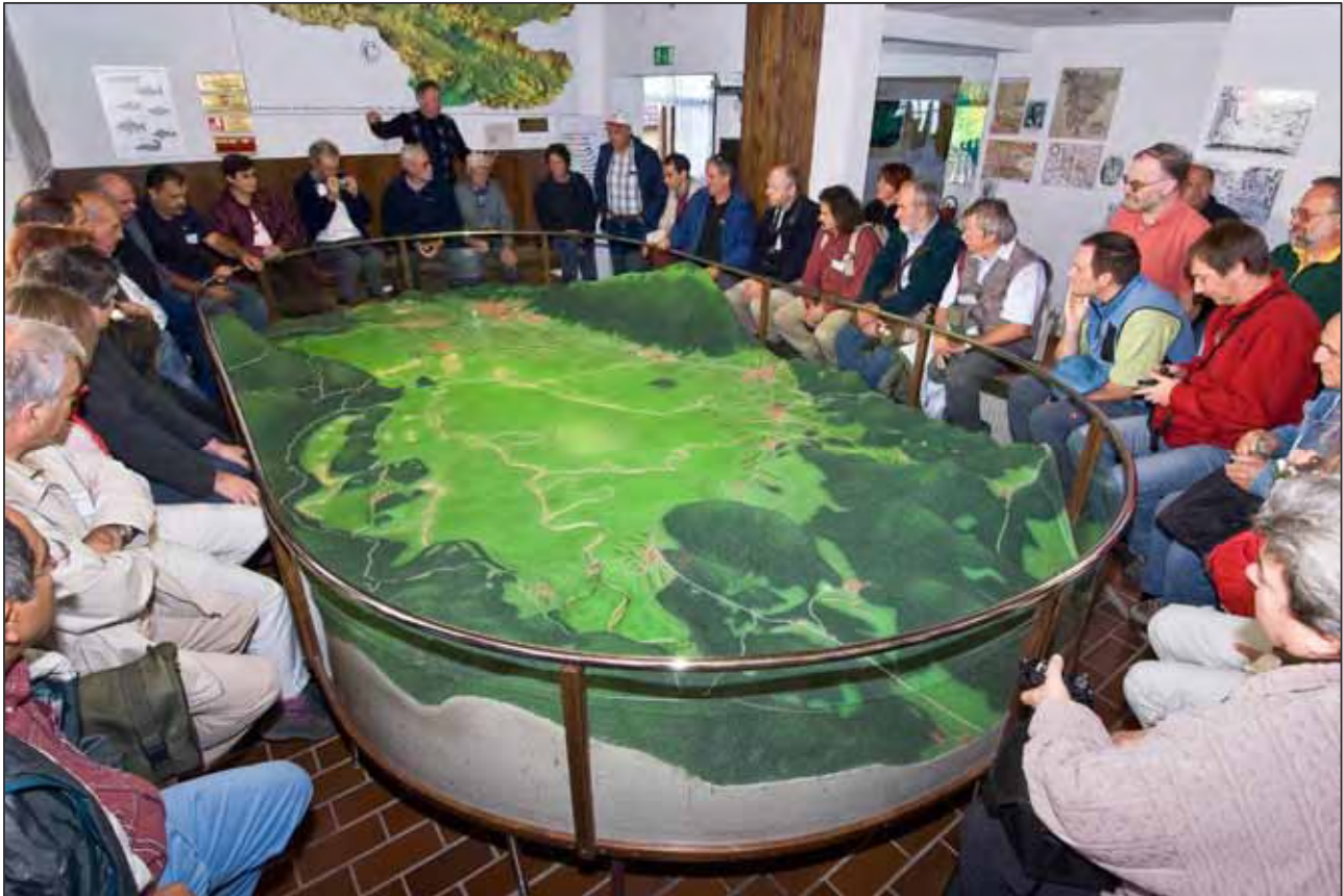
Fig. 1: Participant during the visit of intermittent Lake Cerkniško jezero interpretation model constructed and run by a local inhabitant.