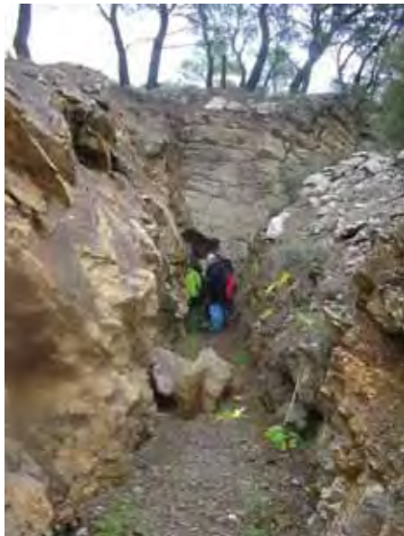
Exploring ancient galleries

The communication process used to "interpret" information is based on Tilden's Interpretive Principles (Tilden, 1954). Tilden's basic communication principles are also the ones you found in every first year marketing or advertising textbook on successful communication with your market (audience). To make remembering Tilden's principles easier we came up with the TIPS (Tilden's Interpretive Principles shorthand), a short hand version of the main principles: