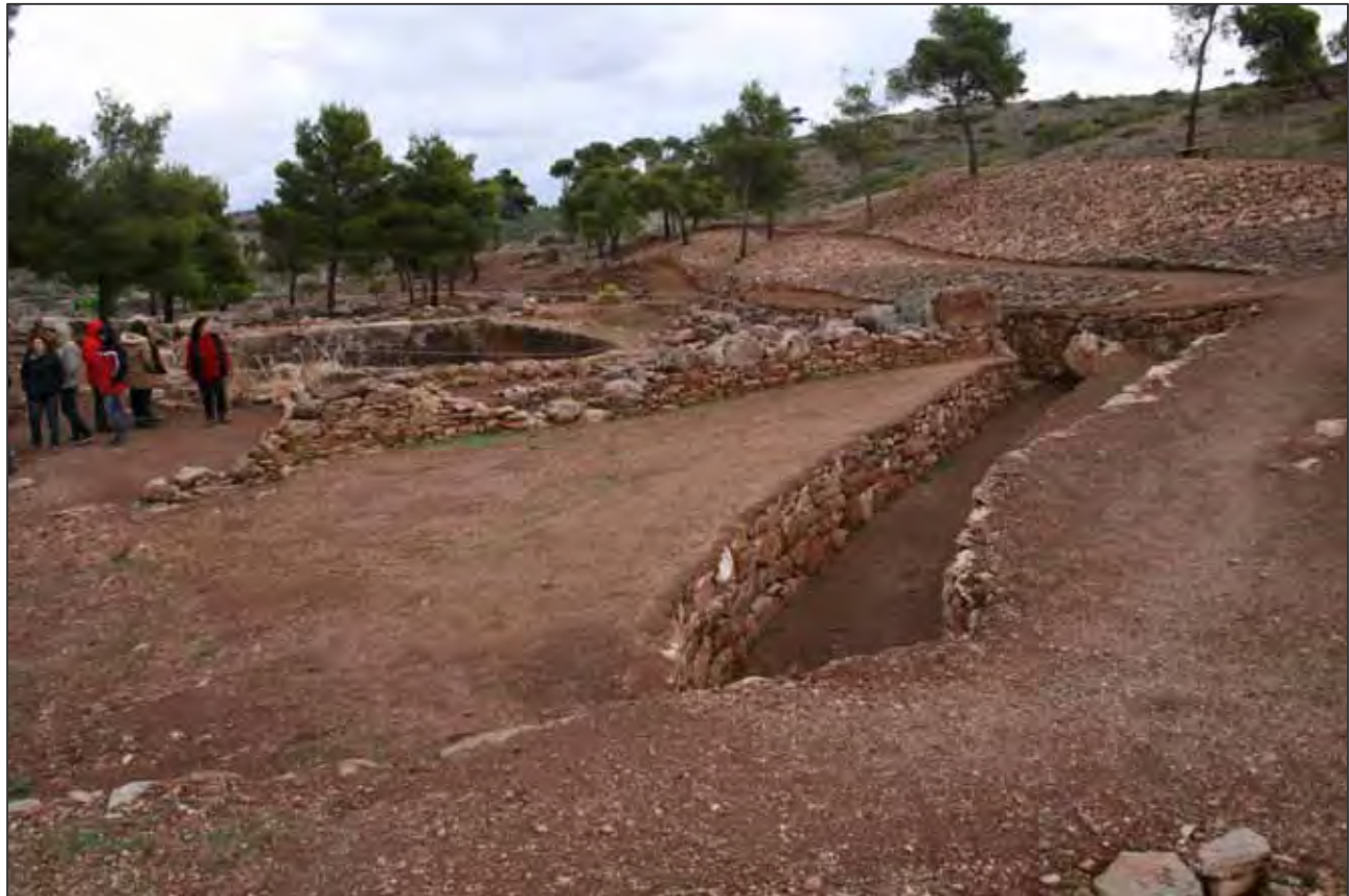
Restored ancient mineral washing plantations

In the evening an open session on “An interpretation general overview” took place. The evening finished with a nice reception.