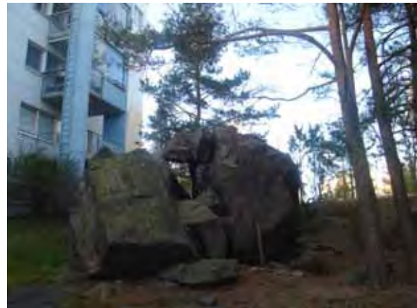
Fig. 2. Preserved boulders in Kyyhksmäki.

In Espoo, boulders are also found in constructed spaces. Boulders are preserved when constructing in their surroundings (Fig. 2). The biggest of them are even protected as geosites and integrated in interpretative trails. However, some of the urban boulders