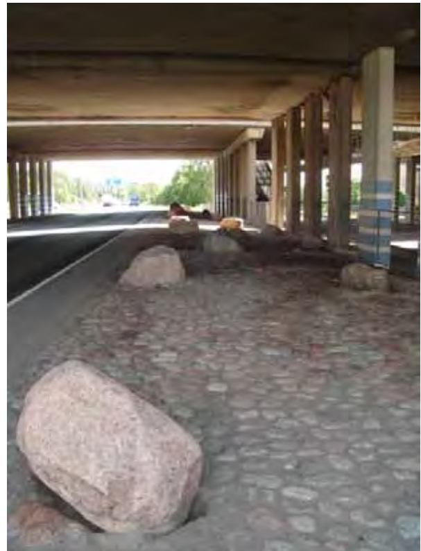
Fig. 6. Use of stones in road environments in Leppävaara.

When used only in landscaping, boulders are installed in groups, half-immersed into the ground, and surrounded by well-rounded glacio-fluvial pebbles (Fig. 5). These examples can be found at Leppävaara, Espoonlahti, Espoon keskus, and Kilo, where boulders decorate margins of bicycle and walkways, and beside a road under a bridge (Fig. 6). They are also used to decorate spaces that separate streets with opposite driving directions (Fig. 7). Those have been designed and proposed by private planning companies, approved by the municipality and