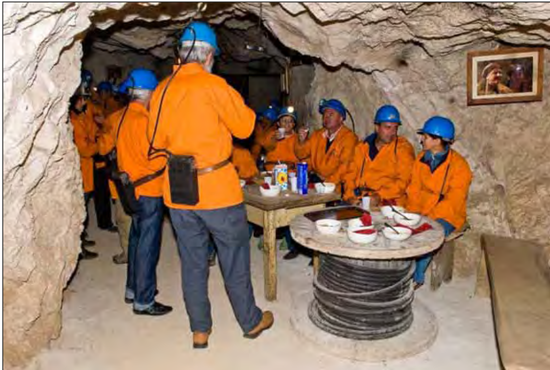
Fig. 3: Participants visited mercury mine in Idria and led and zink mine in Mežica. The photo was taken during the original mining meal in Mežica mine, which is today one of the three tourist mines in Slovenia.

dards meeting UNESCO's Global Geopark standards.