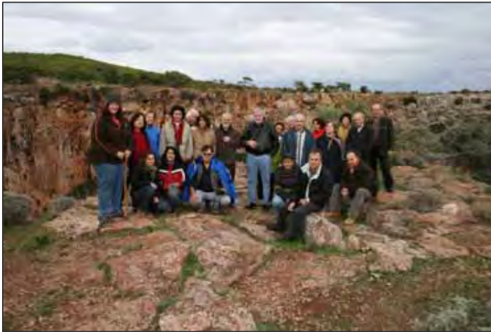
The group on the edge of a doline circumference