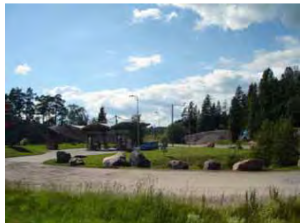
Fig 9. Gas station at Bemböle