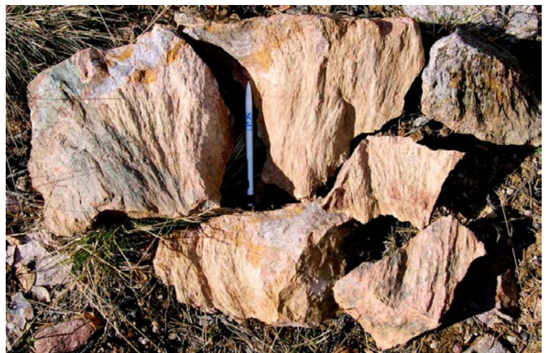
Figure 2 : Plumose structures in granite at largest impact crater in Europe (Siljan ring - 52 km across). It is the source and background for high geoheritage values in the region: not only impact structures and almost vertical Palaeozoic beds that are preserved in the ring structure, but it have also affected Quaternary features and processes.