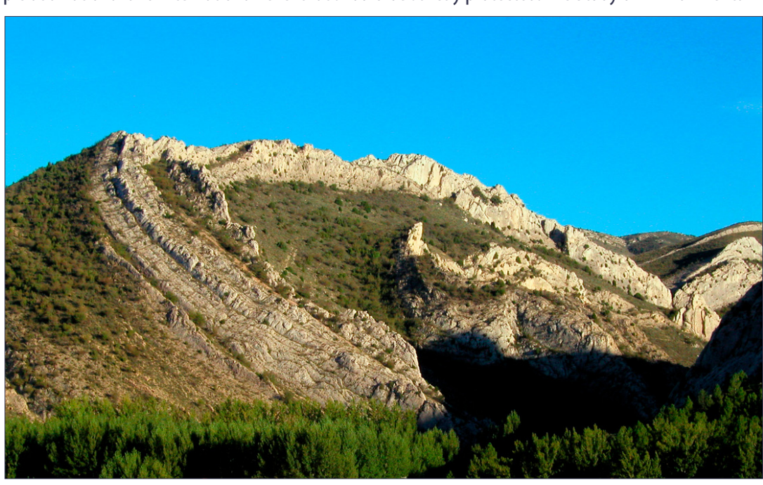
Figure 2 - La Olla vertical anticline, one of the most conspicuous components of the geological landscape of Aliaga

Impact of the wind power project should honestly consider Alternative 0, i.e. the abandonment of the project. This is the most sensible option, and the only one consistent with the preservation of the natural and cultural values that society and the authorities have been recognising and promoting for decades. It is imperative that rigorous land-use planning be undertaken to leave room for the conservation of areas of special interest for landscape, environmental and, as in this case, geological reasons.