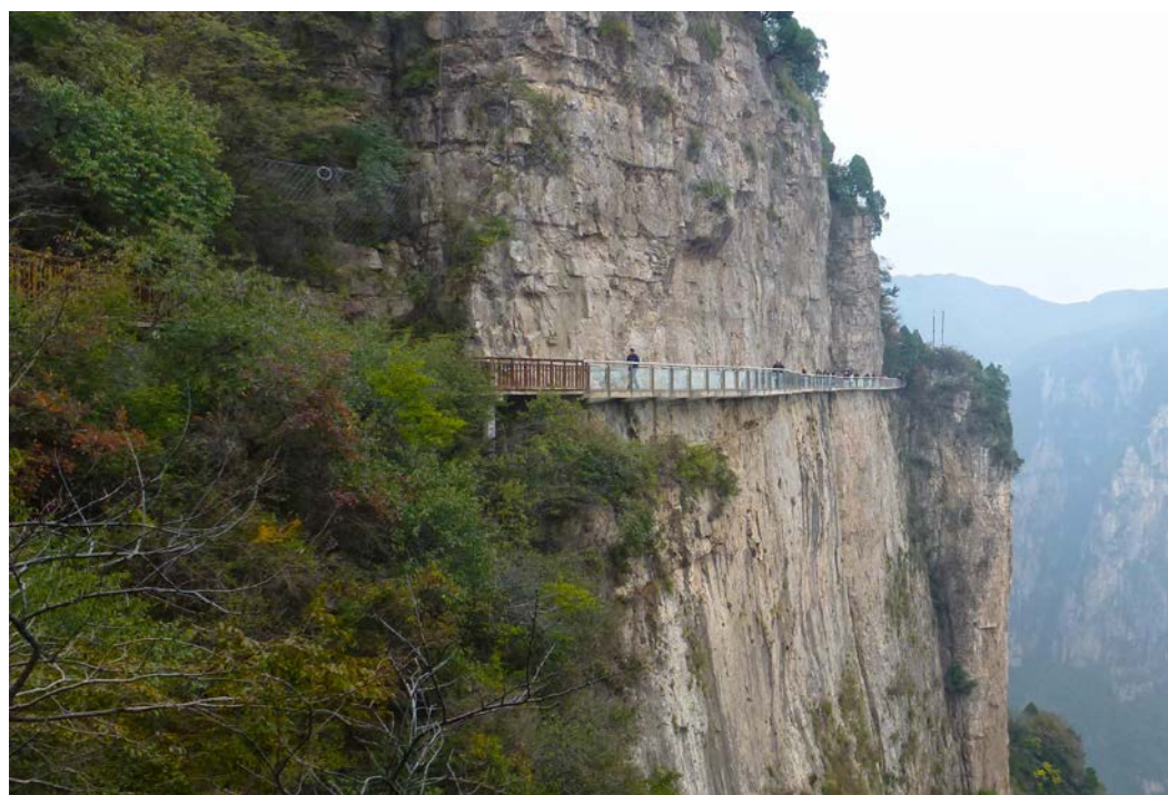
The glass-floored walkway along a limestone cliff

The Global Geopark designation obtained in 2004 has added scientific credibility to the already established tourism base and the group saw many of these tourist facilities and activities during their visit. These included a sound and light show, a cable car trip and a glass walkway along a limestone cliff. The thick, Cambrian/Ordovician limestone sequences overly Precambrian red sandstones, though the contact was not seen on this visit. The group accessed a major trail through Red Rock Canyon with its many waterfalls and walkways cut into the cliffs. Several information panels along the way describe the characteristics of the red sandstones.