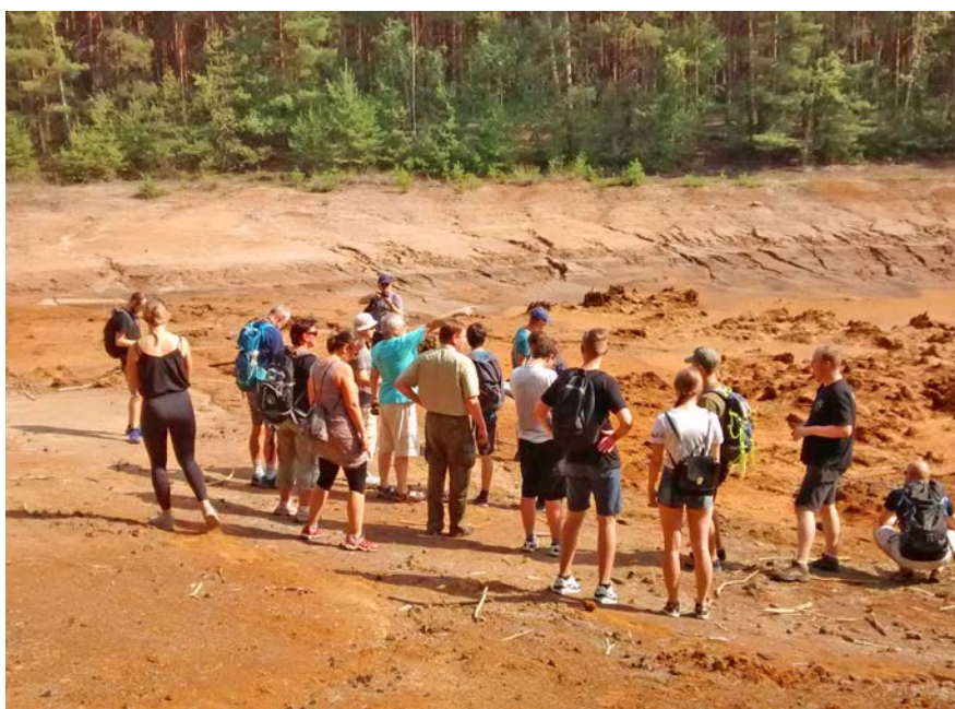
Former Babina mine geotourist trail

The GECON Project concerns cross-border collaboration between institutions and communities from Poland and the Czech Republic that deal with research, conservation and promotion of geological heritage in the cross-border area (for more information see Useful links). Along with workshops and field trips, the Summer School on Geotourism is one of the three forms of field activities defined within this programme. It is held annually during the 2018–2021 timeframe of this Project. In 2019, the Summer School was held on 26–30 August and gathered the representatives of all the Project's partners: Geopark Ralsko o.p.s. (lead partner), Technická Univerzita v Liberci, MAS Chrudimsko, z.s., Muzeum Regionalne w Lubaniu, Stowarzyszenie Geopark Przedgórze Sudeckie, Česká Geologická Služba, Państwowy Instytut Geologiczny - Państwowy Instytut Badawczy (the main organiser of the 2019 Summer School).